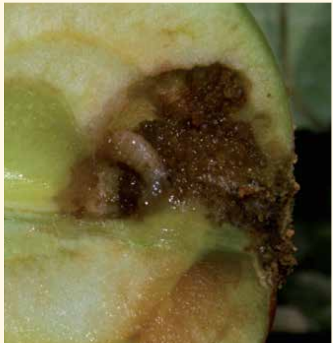
Above: Codling Moth damage on apples – example of deep damage.