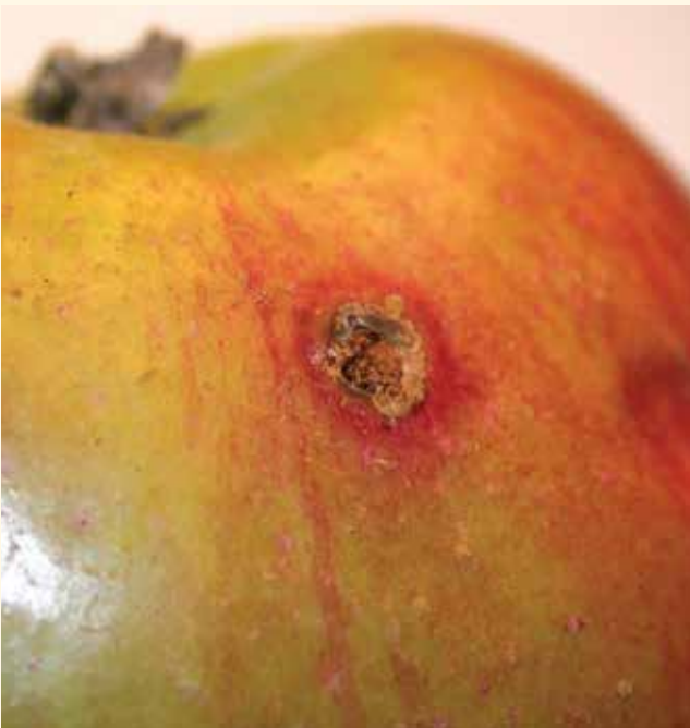
Above: Codling Moth damage on apples – example of superficial damage.

The Madex ® program (100 ml up front and then 10 ml weekly) performed exceptionally well and was the best treatment overall.