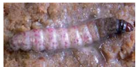
Photos above: Codling Moth larvae infected with virus particles.