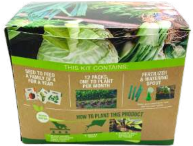
BACK OF BOX