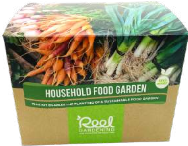
FRONT OF BOX